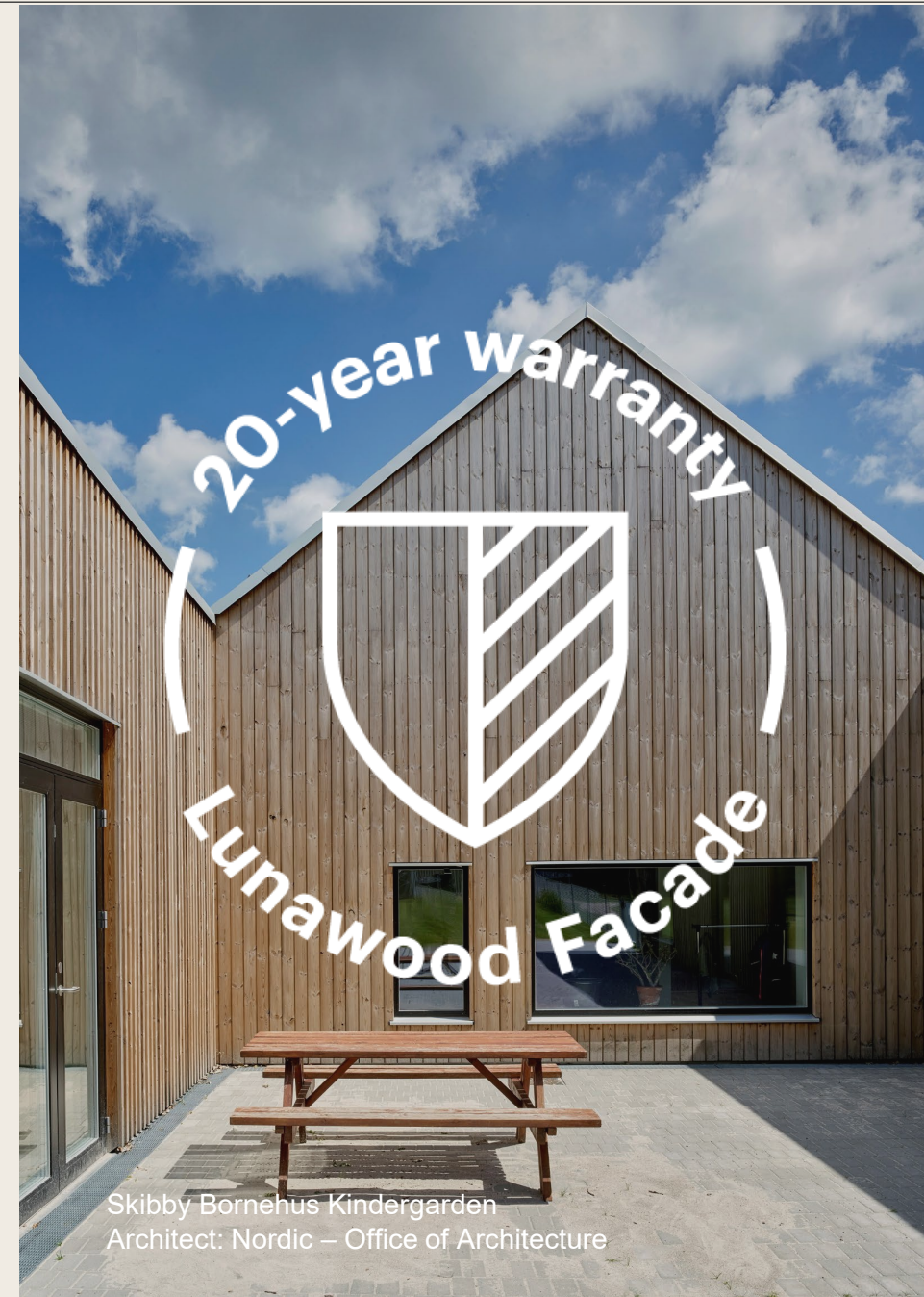
Skibby Bornehus Kindergarden Architect: Nordic – Office of Architecture